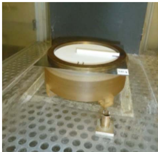
FIG. 4 Close-up of a Test Cigarette on the Stainless Steel/Paper Substrate

7.7 Cigarette Ignition System—A system consisting of an air draw component and an ignition source shall be used to ignite the test cigarettes. The cigarette shall be supported in a