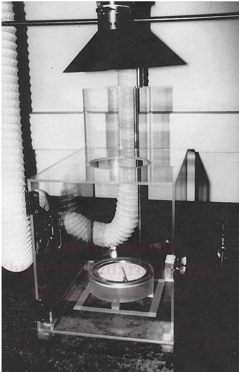
FIG. 1 Photograph of Test Chamber and Holder for the Filter Paper Substrates