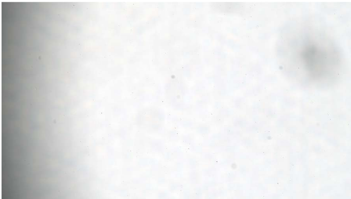
FIG. 5 Observation After Dissolution End Point

13.19.2 If asphaltenes are still present but the population density is reduced significantly then proceed to 13.20.