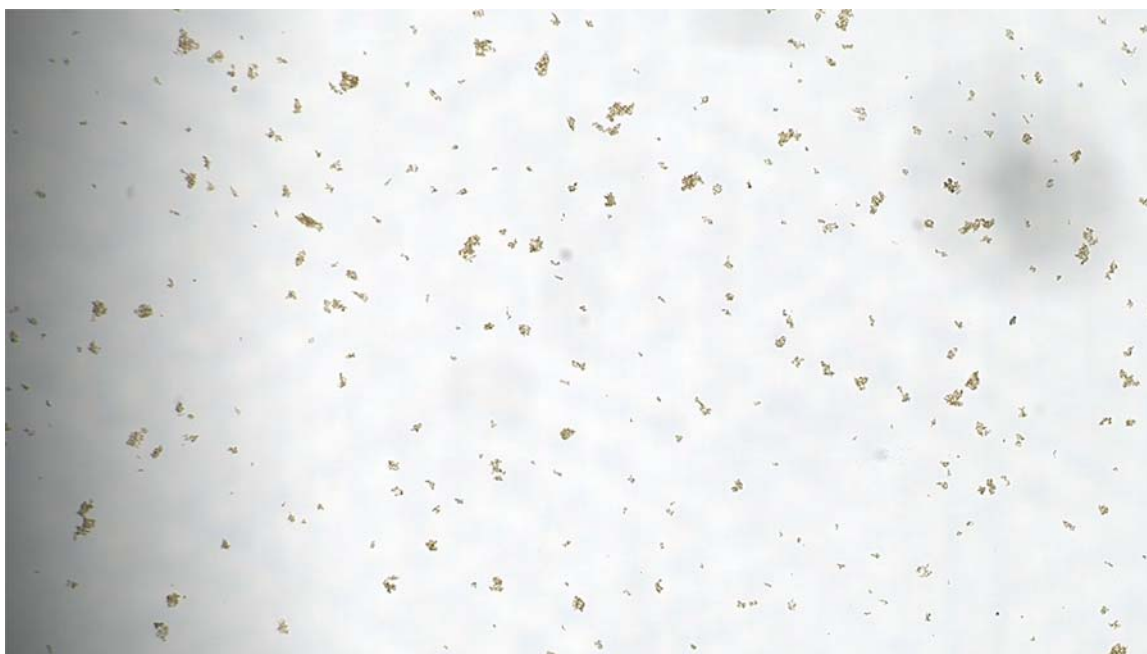
FIG. 4 Observation Nearing Dissolution End Point

13.19.1 If there is still a large population of asphaltenes present, then repeat steps 13.13 – 13.19 until the population of asphaltenes is reduced significantly.