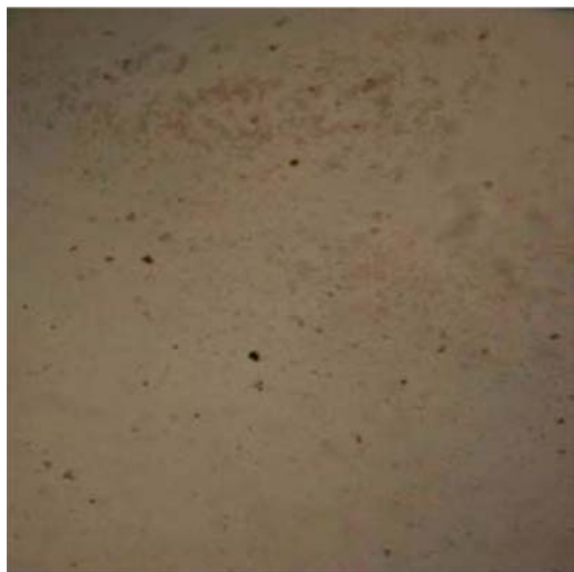
FIG. 2 Normal Light

9.2.6 If there are significant solids present (crystalline or amorphous) that will make differentiation of changing asphaltene populations during the test procedure difficult, then the sample will need to be cleaned as per Section 10. If there are no solids present or only solids that are easily distinguishable as background materials and will not interfere with the test procedure, then proceed to Section 11.