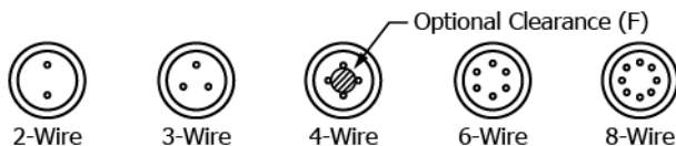
FIG. 1 Examples of Conductor Wire Configurations

6.2 Conductor Resistance Match —The resistance of each conductor shall be measured. The difference between the maximum conductor resistance and minimum conductor resistance shall not exceed 10 % of the minimum conductor resistance.