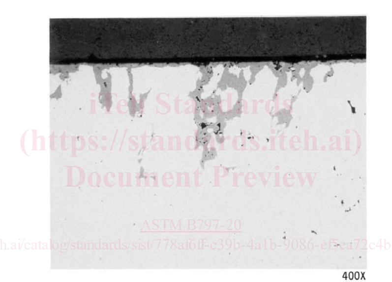
FIG. 1 Example of Surface Finger-Oxide Penetration Extending Inward from the Powder Forged Part Surface (Shown more clearly at high magnification)