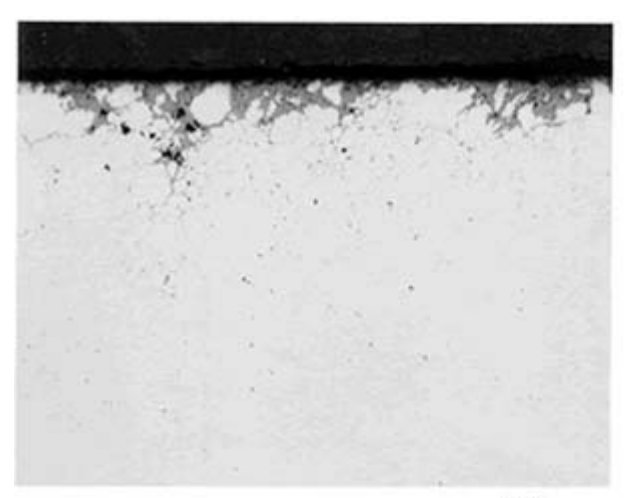
₩ B797 – 20