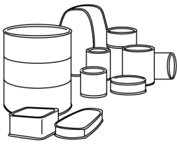
FOOD CANS AND GENERAL PURPOSE CANS