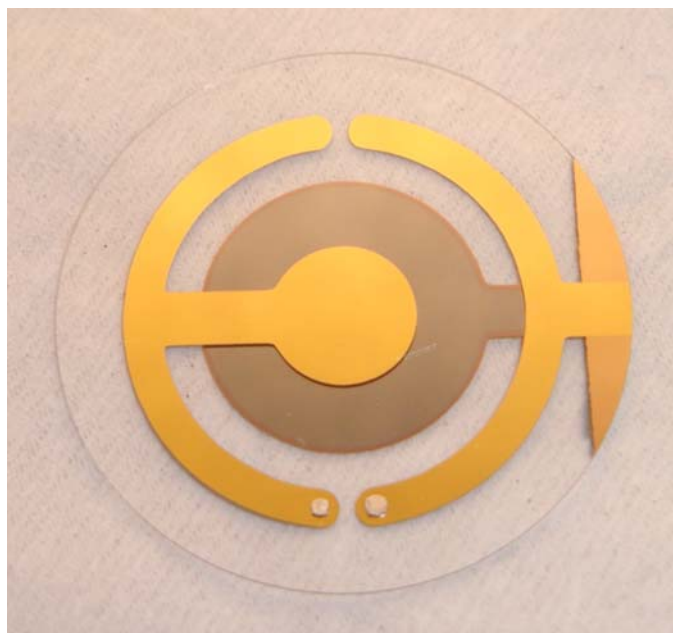
FIG. 2 Quartz Crystal (Front) Showing Proper Location of Indium Wire