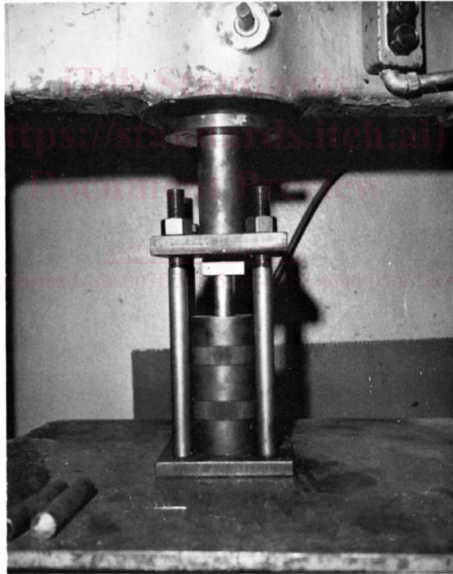
FIG. 3 A Typical Assembled Pressure Vessel