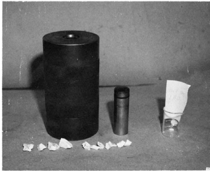
FIG. 2 Typical Unassembled Pressure Vessel and Samples