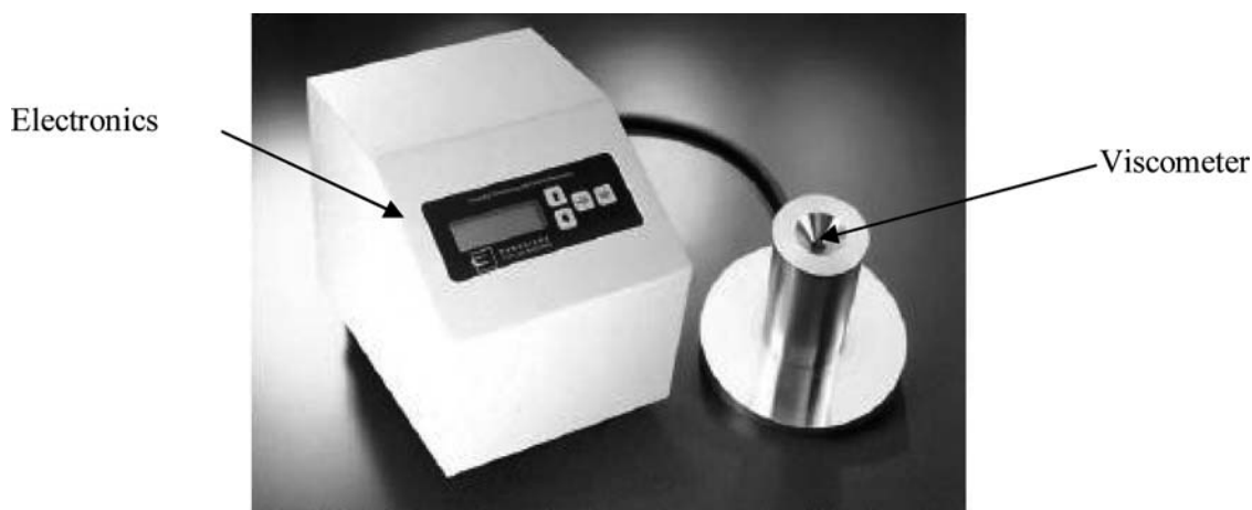
FIG. 1 Viscometer with Electronics

3.1.2 dynamic viscosity ( \eta ), n —the ratio between the applied shear stress and rate of shear of a liquid at a given temperature.