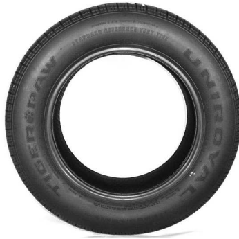
FIG. 2 Side View of the P225/60R16 97S Radial Standard Reference Test Tire