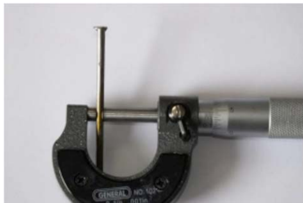
FIG. A2.1 Proper Method Of Measuring

A2.2.2 Open spindle of micrometer and place nail between anvil and spindle. (Fig. A2.1 and Fig. A2.2) gently turn the spindle to bring the measuring surfaces into contact with the