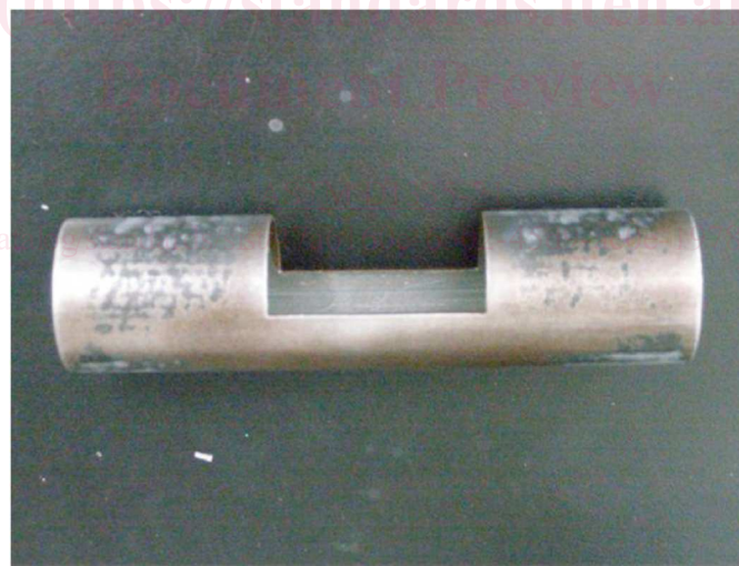
FIG. 2 Cylinder Configuration

6.5 Loop Hook , for use with loop pile specimen. The hook should be designed to readily pass through a tufted loop. The hook should be made of steel wire having a diameter of at least \frac{1}{32} in. (0.8 mm). The wire must be constructed so that it can be hooked into the test specimen and then clamped/attached to, or replace, the measuring clamp of the test machine. (See Fig. 4).