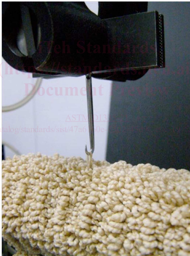
FIG. 4 Loop Hook Secured in the Upper Clamp (Note the hook has been passed through the loop)

NOTE 2—An adequate specification or other agreement between the purchaser and supplier requires taking into account the variability between rolls or pieces of pile yarn floor covering and between specimens from a roll or pieces of pile yarn floor covering to provide a sampling plan with a meaningful producer's risk, consumer's risk, acceptable quality level, and limiting quality level.