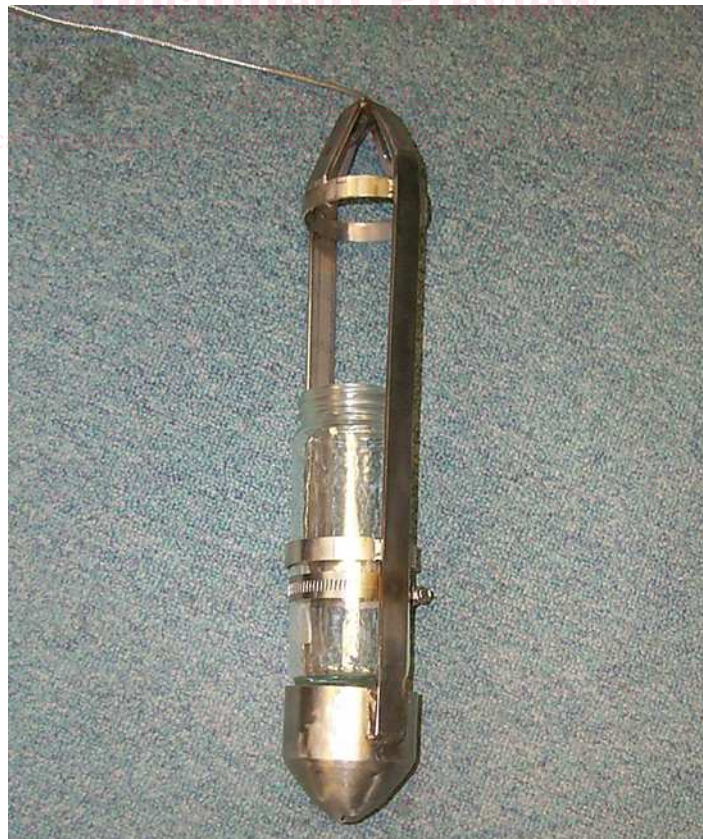
FIG. 1 "Bottle on a String" Sampler

7.2 Auger samples are taken by encasing an auger in a shroud to contain the sample. The auger is rotated through the sample while