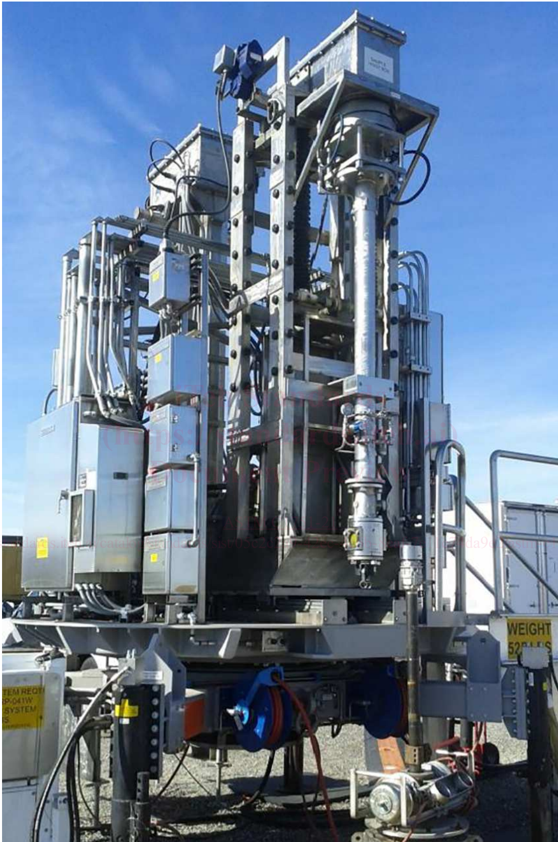
FIG. 4 a. Core Sampling Platform