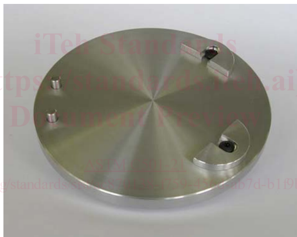
FIG. 2 Drive-pin Type Specimen Holder (Model E140-19)

test specimen. Model E140-19 has been found satisfactory for this purpose (see Fig. 2).