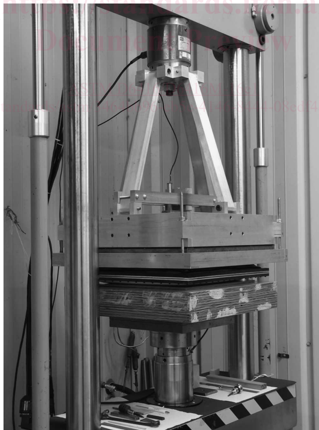
FIG. 3 Two-Dimensional Plate Flexural Test Apparatus