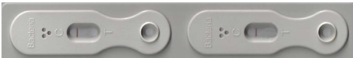
FIG. 5 Bacteria LFD Detecting >750 \mu\text{g} Antigen/L Fuel Phase or >166 \mu\text{g} Antigen/mL Aqueous Phase: No Test Lines Visible