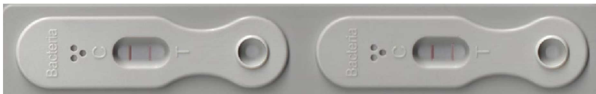
FIG. 3 Bacteria LFD Detecting \leq 150 \mu\text{g Antigen/L Fuel Phase} or \leq 33 \mu\text{g Antigen/mL Aqueous Phase} : Both Test and Control Lines Visible

12.1.7 The location of the sampling point and the sampling method.