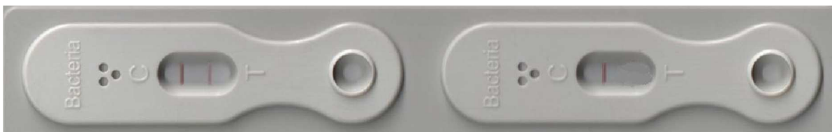
FIG. 4 Bacteria LFD Detecting >150 \mu\text{g} to \leq 750 \mu\text{g} Antigen/L Fuel Phase or >33 \mu\text{g} Antigen/mL Aqueous Phase and \leq 166 \mu\text{g} Antigen/mL Aqueous Phase: Test Lines are Visible Only on the High-Range (Left) LFD