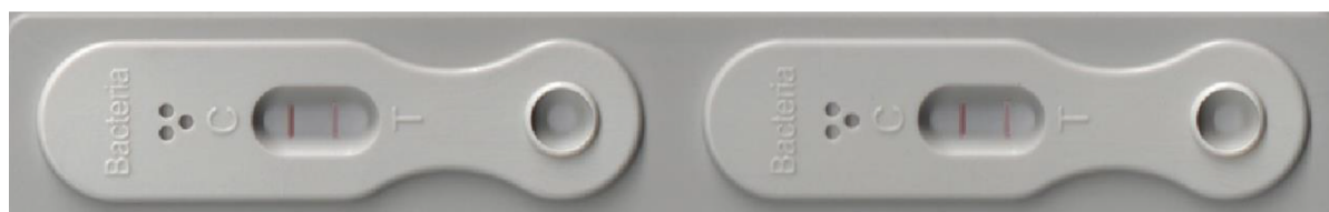
FIG. 3 Bacteria LFD Detecting ≤150 µg Antigen/L Fuel Phase or ≤33 µg Antigen/mL Aqueous Phase: Both Test and Control Lines Visible