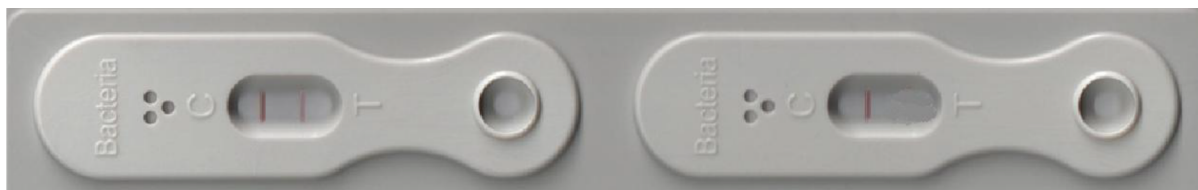
FIG. 4 Bacteria LFD Detecting >150 µg to ≤750 µg Antigen/L Fuel Phase or >33 µg Antigen/mL Aqueous Phase and ≤166 µg Antigen/mL Aqueous Phase: Test Lines are Visible Only on the High-Range (Left) LFD