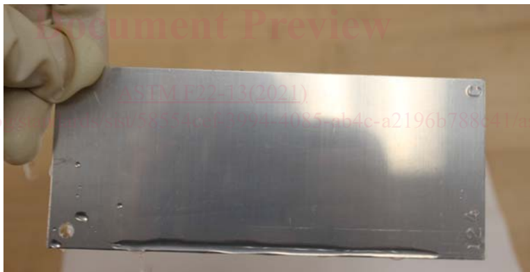
FIG. 2 Clean aluminum panel showing no water break. Water drains in a continuous sheet.

12.1 contact angle; hydrophilic films; organic contamination; surface contamination; water break