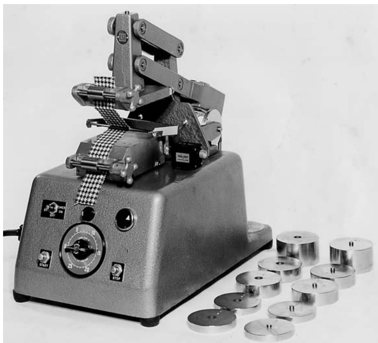
FIG. 2 Commercial Flexing and Abrasion Tester

indication, working range, capacity, and elongation indicator and designed for operation at a speed of 300 \pm 10 mm/min ( 12 \pm 0.5 in./min); or, a variable speed drive, change gears, or interchangeable full-scale force range as required to obtain 20 \pm 3 s time-to-break.