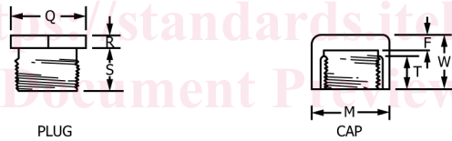
TABLE 2 Dimensions of Plugs and Caps, in. A,B

C This dimension locates the end of the fitting.