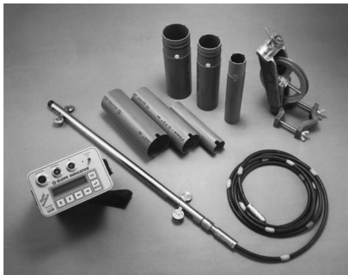
FIG. 1 Typical Components of Method A Inclinometer System

5.1.1 An electrical cable with distance markings connects the probe and power supply (which may also include the readout). Fig. 1 illustrates a typical set of components. The