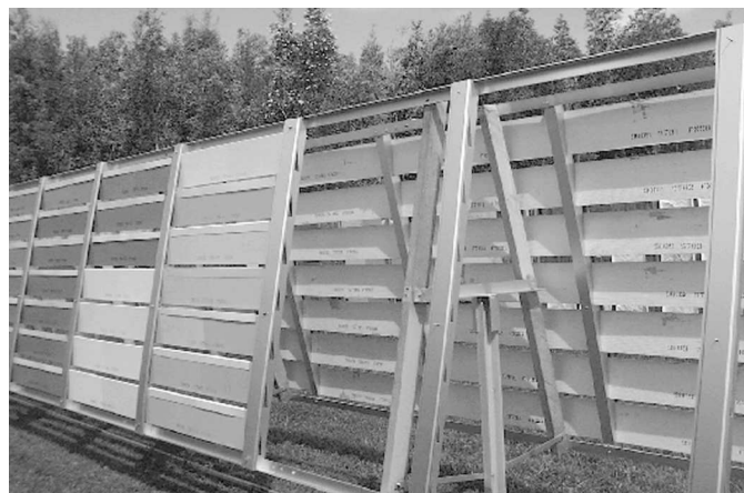
FIG. 1 Typical Exposure Rack

7.1 Choose a wood substrate in accordance with Specification Practice D358D7787. Prior to use, test lumber and panels shall be stored under such conditions that the moisture content of the wood will be maintained within the normal range for exterior woodwork in the region in which the tests are conducted. Exposures on wood substrates should be performed on three panels to