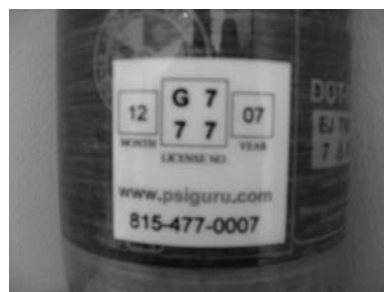
Label attached to bottle with epoxy

(2) After hydrostatic testing, the retest date will look like this: