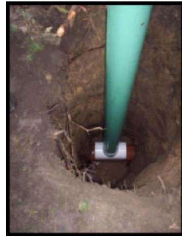
FIG. 4 Vacuum Excavated Borehole