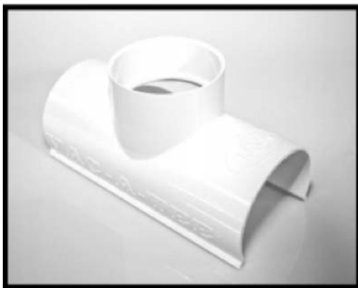
FIG. 1 Saddle greater than 180°

8.2 A borehole approximately 20-in. in diameter is created by vacuum excavation. This is accomplished by cutting the soil by use of compressed air or by water jetting. The loosened soil is simultaneously drawn under a controlled vacuum through suction tubing and discharged into a mobile debris tank (Refer to Fig. 3). This process continues until the lateral pipe is exposed. The sewer service pipe is cleaned to remove debris. The cleaning process is accomplished by using an extendable water pressure cleaning nozzle. A saddle is affixed to one end of a PVC riser pipe using solvent cement in accordance with Practice D2855. The elastomeric adhesive/sealant is applied to the underside of the saddle. The pipe and saddle are lowered down into the hole until the saddle contacts the pipe, a manual