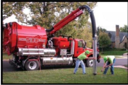
FIG. 3 Vacuum Excavation Equipment

or concrete or asphalt. The adhesive/sealant is typically cured within 12 h of application and can be water tested any time thereafter. Once the saddle connection has been tested and confirmed to be verifiably non-leaking, the crown of the lateral pipe is cored and the cored coupon is retrieved through the core bit. The surface is then restored to its original condition