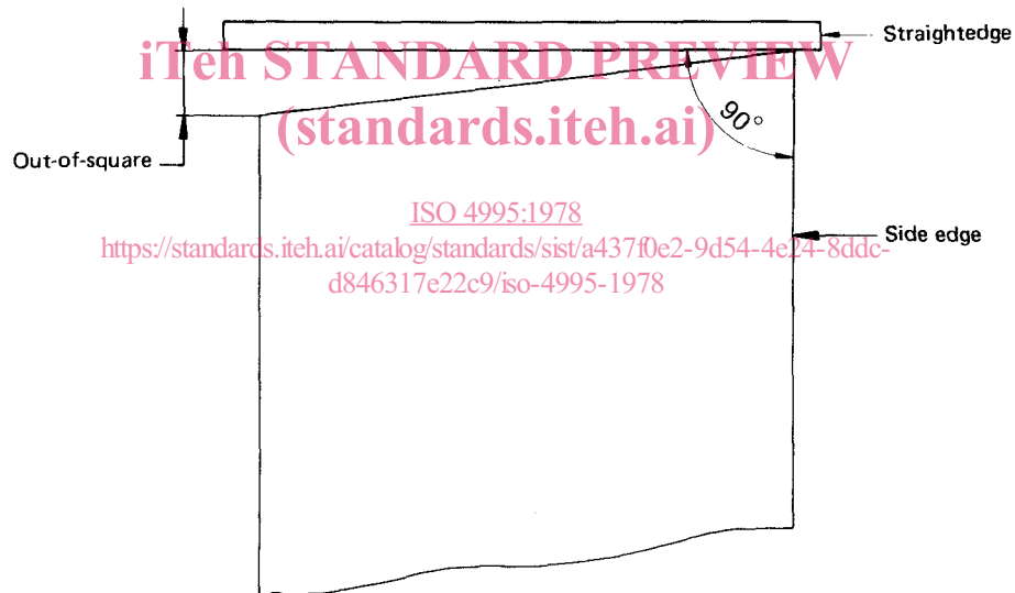
FIGURE 3 – Measurement of out-of-square

2) When measuring material to resquared tolerances, consideration may have to be given to extreme variations in temperature