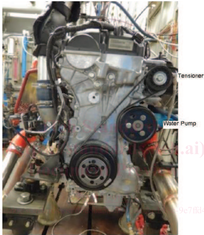
FIG. 3 Water-Pump Drive Arrangement