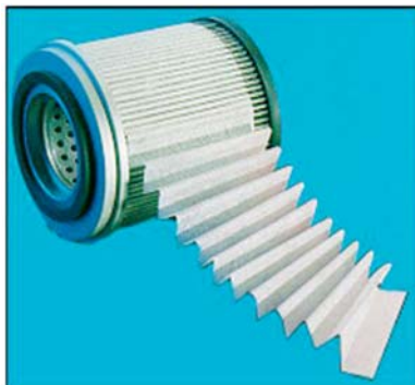
FIG. 1 Filter Element with Removable Diagnostic Layer

7.4 Media for Debris Deposition —Once the debris has been extracted from the filter, it must be captured on some media to