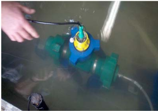
FIG. 1 (b) Photo of Part Under Test (continued)