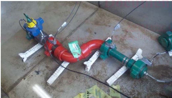
FIG. 2 (b) Sensors 1–4, of A Typical Non-immersed Test (continued)