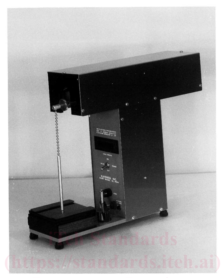
FIG. 1 Electro-Mechanical Device

specimens shall be tested. If the test specimens are taken from a roll, care should be taken that the roll is in good condition. Best results are obtained when specimens are taken at least 25 mm below the outer surface of film rolls.