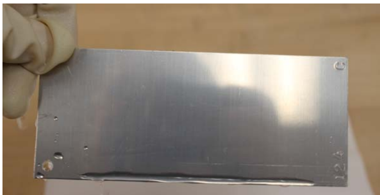
FIG. 2 Clean Aluminum Panel Showing No Water Break; Water Drains in A Continuous Sheet

12.1 contact angle; hydrophilic films; organic contamination; surface contamination; water break