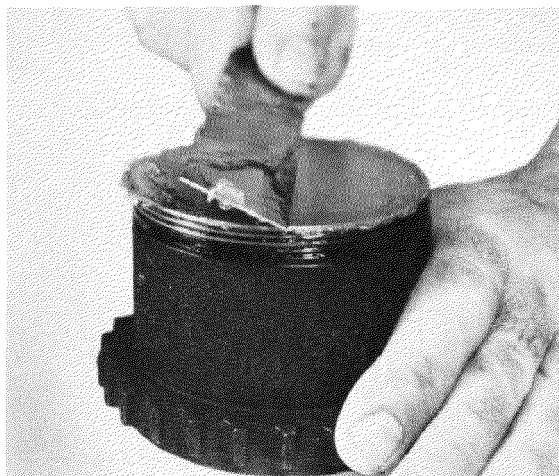
FIG. 2 Preparing Sample for Penetration Measurement

across the rim of the cup (Fig. 2). This excess grease will be retained to repair the surface for the second and third determinations. Do not perform any further leveling or smoothing of the surface throughout the determination of unworked penetration and determine the measurement immediately.