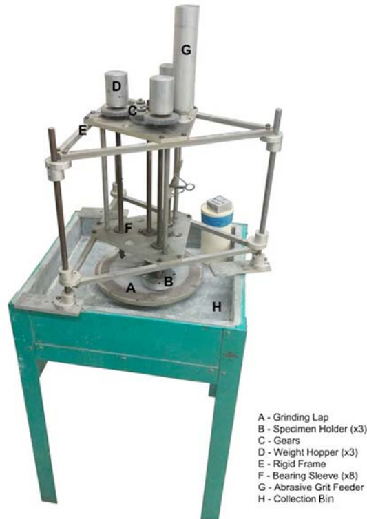
FIG. 1 Apparatus for Abrasion Resistance Test of Stone