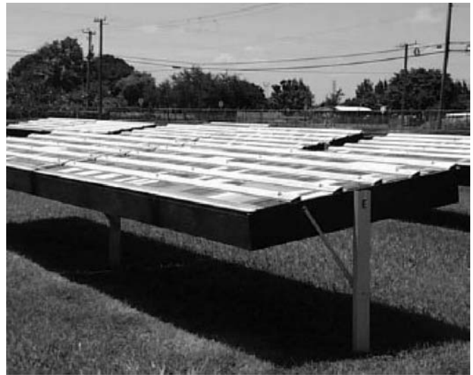
FIG. 1 Black Box in Use (from Practice G7 )

NOTE 5—As an alternative procedure, reserve unexposed duplicate