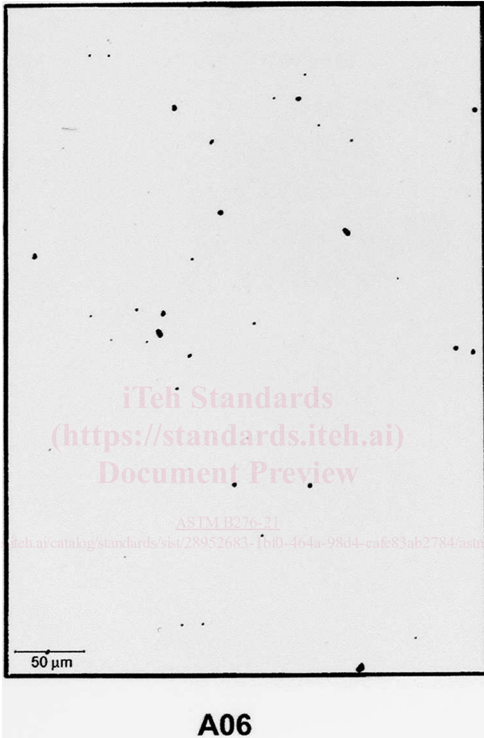
FIG. 1 (c) Type A Apparent Porosity (This figure is reprinted from ISO 4499-4:2016.) (continued)