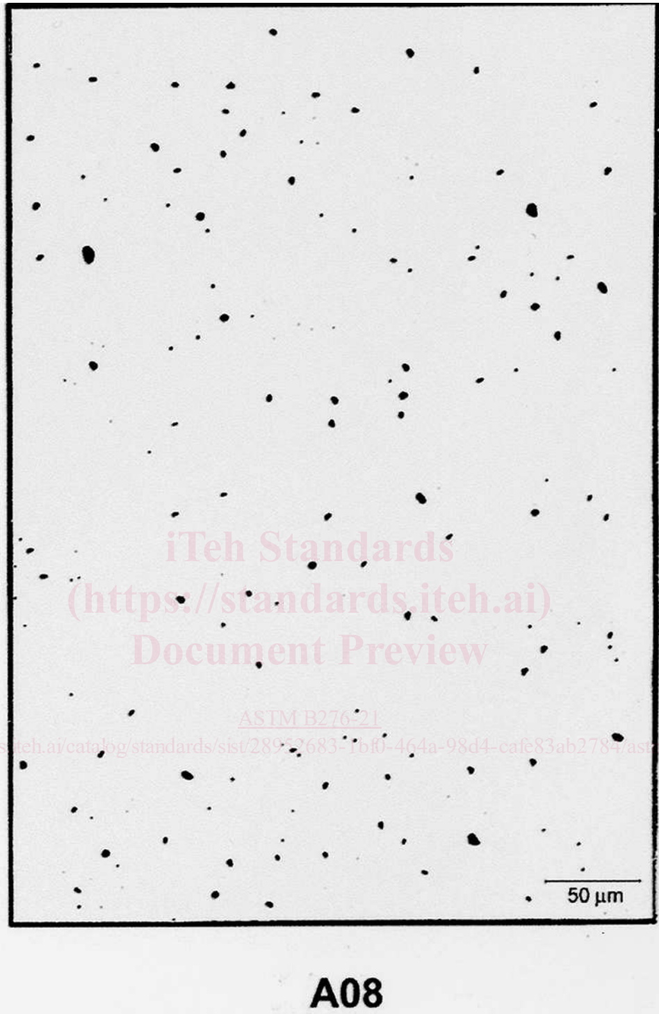
FIG. 1 (d) Type A Apparent Porosity (This figure is reprinted from ISO 4499-4:2016.) (continued)