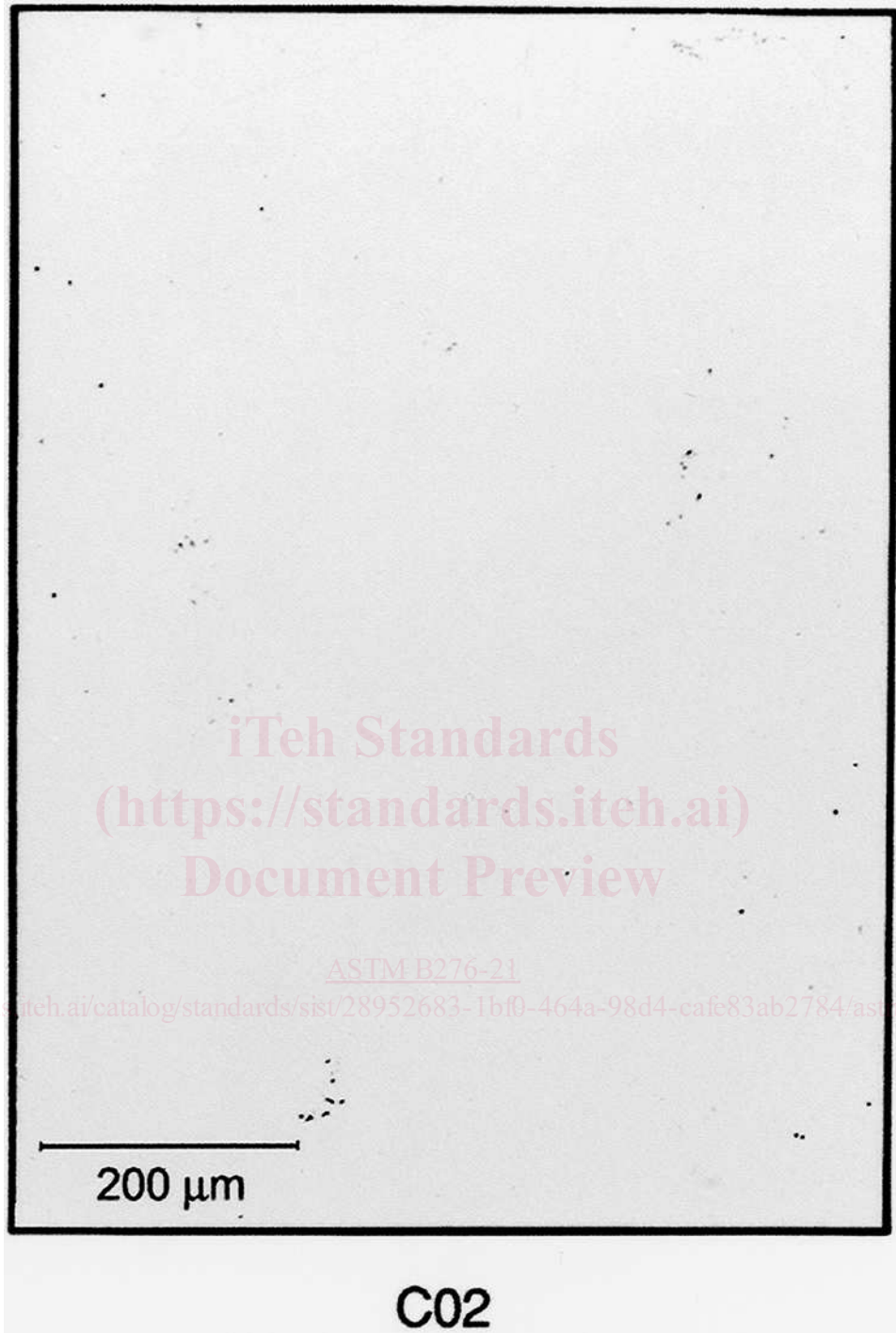
FIG. 2 (a) Uncombined Carbon (This figure is reprinted from ISO 4499-4:2016.)