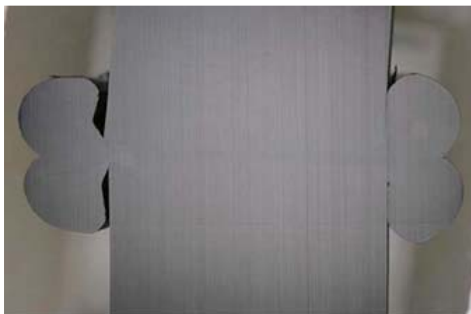
FIG. 1 Typical Bead Profile for Polyethylene Butt Fusion Joint

tionally recognized NDT personnel qualification practice or standard such as ANSI/ASNT-CP-189, SNT-TC-1A, NAS-410, ISO 9712, or a similar document and certified by the employer or certifying agency, as applicable. The practice or standard used and its applicable revision shall be identified in the contractual agreement between the using parties.