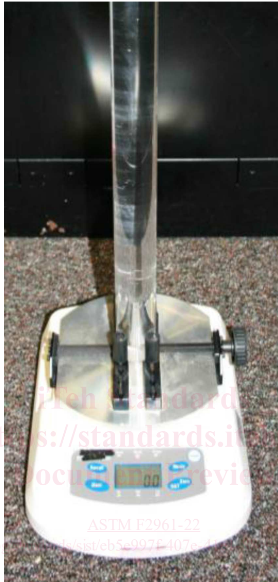
FIG. 1 Acrylic Rod Attached to a Torque Meter

(1) Cover the metal pins with a rubber material that is between 2.5 and 3.0 mm thick.