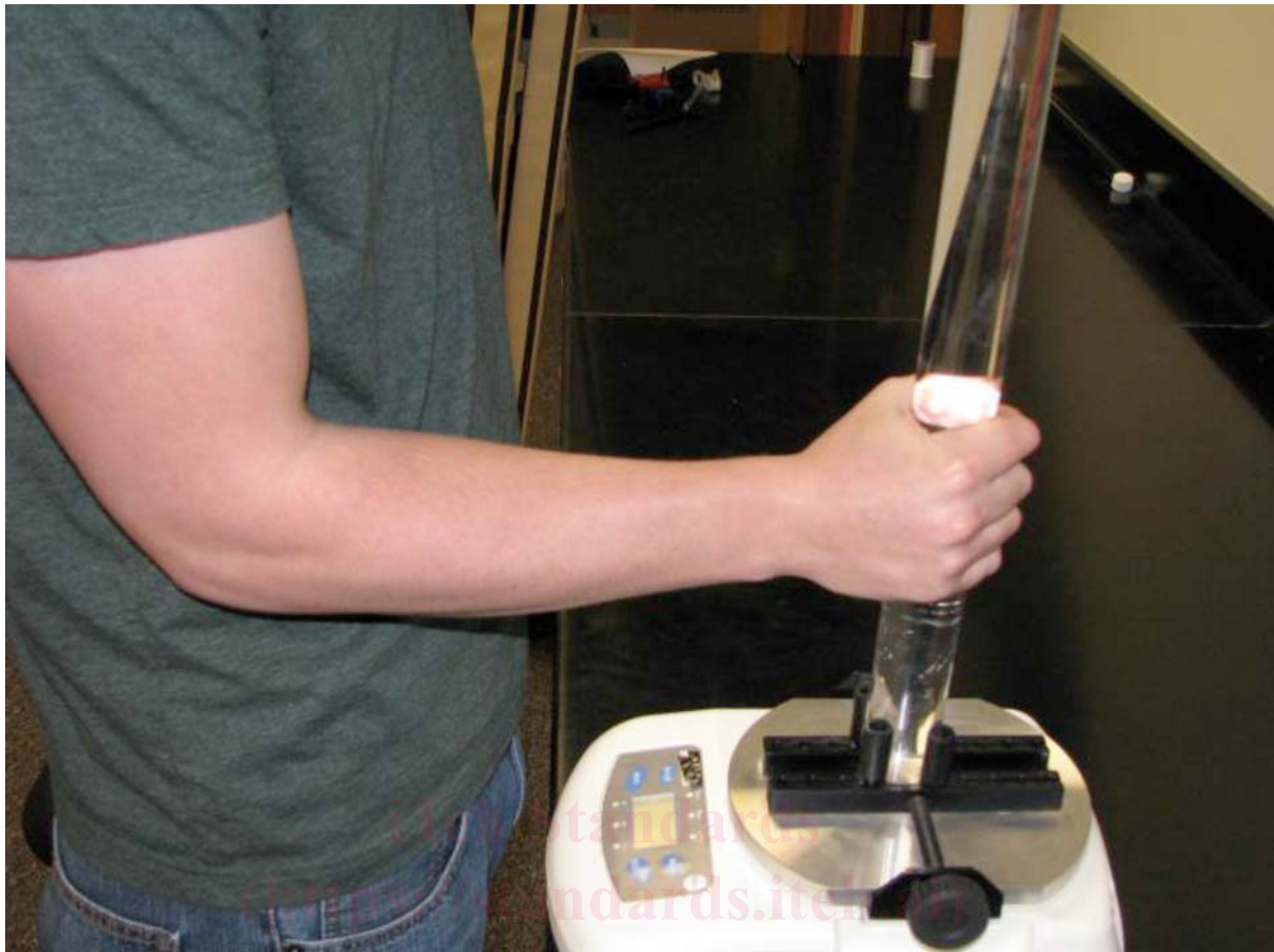
FIG. 3 Example of a Correct Testing Position

9.5.3.3 Record the maximum torque applied after each repetition.