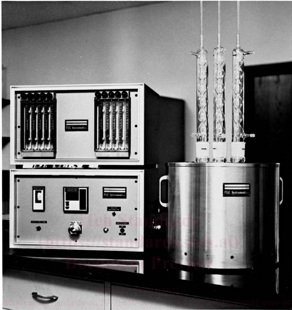
FIG. 1 Universal Oxidation Test Apparatus

4.2 Procedures using this apparatus are described in the following ASTM standard test methods: D5763 , D5846 , and D6514 . Other procedures may be in use, but they have not been developed as ASTM standard test methods.