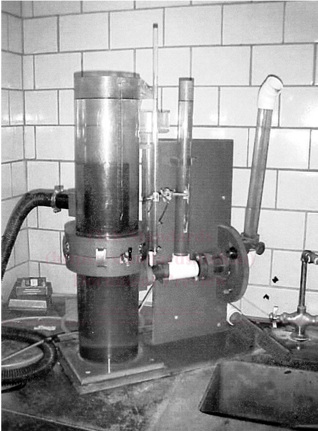
FIG. 1 Constant and Falling Head Permeability Apparatus

6.4.2.2 The tail (downstream) pressure sensor must be installed 25 mm or more from the geotextile test specimen, and within the 25 mm diameter section.