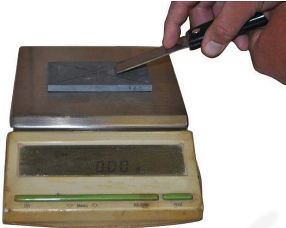
FIG. 3 Slate Specimen Prepared for Test with Hand Scraping