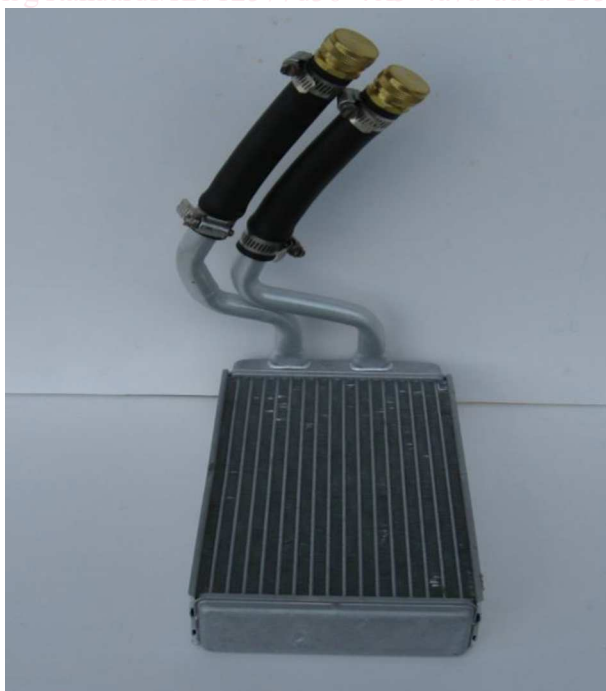
FIG. 1 Aluminum Heat Exchanger with Hoses, Clamps, and Caps

9.4 Test Termination —Remove the heat exchanger from the oven and cool to room temperature. Pick up the heat exchanger from