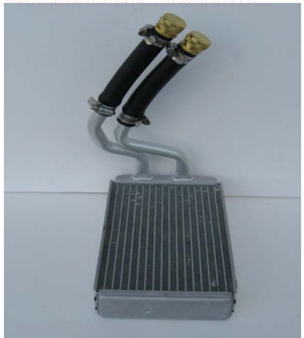
FIG. 1 Aluminum Heat Exchanger with Hoses, Clamps, and Caps

NOTE 3 —Maintaining the correct temperature within the specified limits of \pm 2\text{ }^{\circ}\text{C} during the entire test run is an important factor for assuring both repeatability and reproducibility of the test results. Care should be taken to maintain a constant airflow across the heat exchanger’s external heat transfer surfaces (fin, tube). No direct radiant heating is permitted.