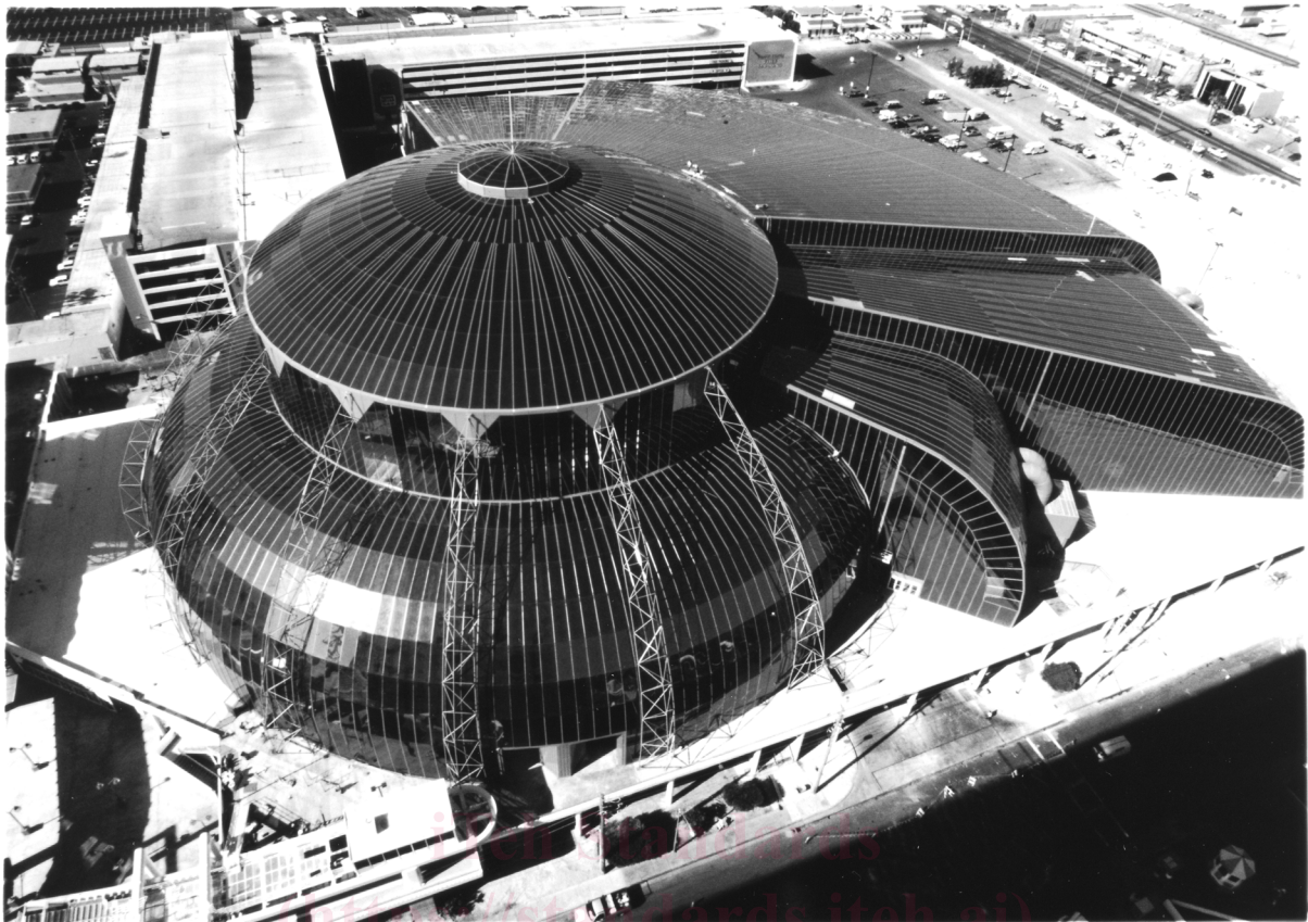
FIG. 5 Sloped SSG System

weight of the glass or panel. If outward sloped, a dead load due to the weight of the glass or panel exists, which creates a downward and outward force on the structural sealant joint. Sloped SSG systems conceptually are the same as vertical two- and four-side SSG systems except for the degree and direction of slope from vertical, method of water infiltration management, and structural design of glass and structural sealant for a sloped configuration (17). Many sloped SSG systems are two-side structural sealant systems that are construction-site glazed (18, 19).