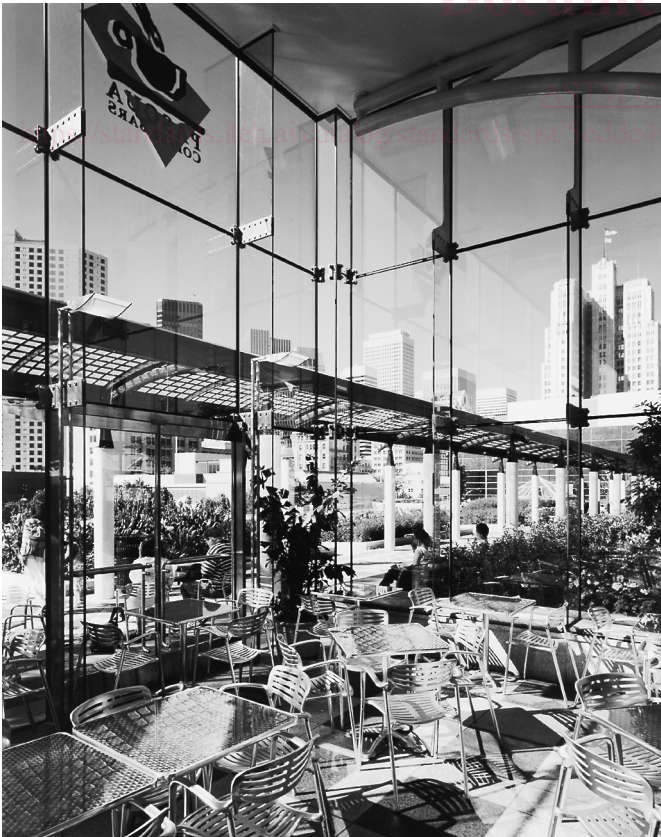
FIG. 6 Glass Mullion System

20.1.2 The codes, rules, and methods employed in the structural design of metal framing systems for conventional glazing also are applicable to structural sealant glazing. The framing members must be compatible with the type and quality of support required for a glass lite or other panel (20). In general, for individual glass lites, the framing members should be designed to not exceed a deflection normal to the wall of L/175 between supports, with a 19 mm ( 3/4 -in.) max, and a deflection parallel to the wall of L/360 , with a 3 mm ( 1/8 -in.) max, whichever is less. When a metal framing member is supporting multiple glass lites, AAMA TIR-A11-1996 should