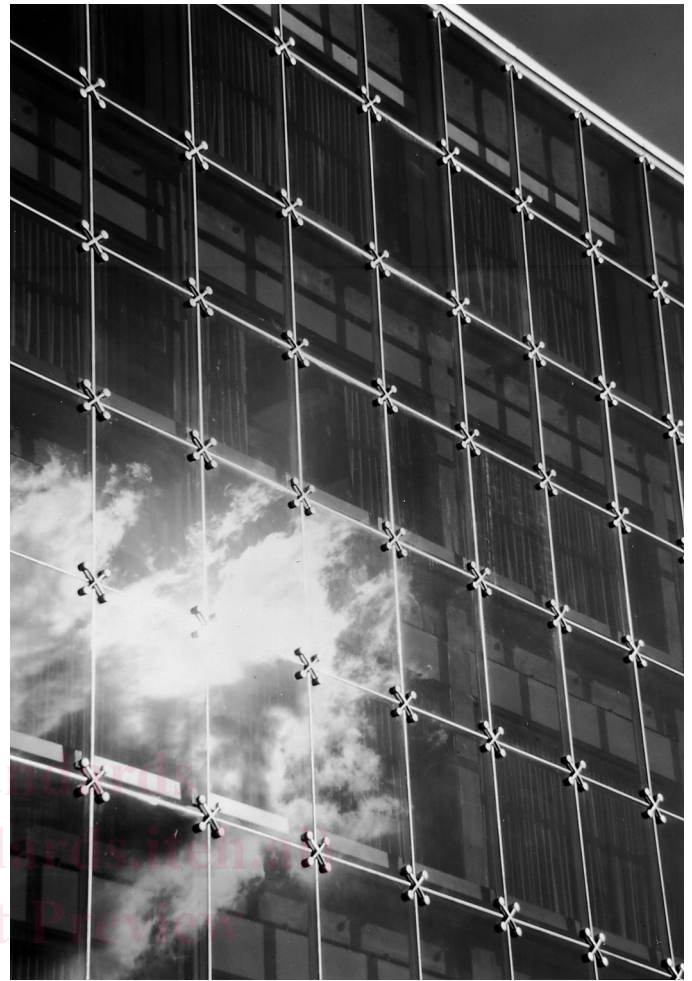
FIG. 4 Four-Side SSG System

16.3.3 To gain optimum control of structural sealant application and minimize the risk of a structural sealant failure,