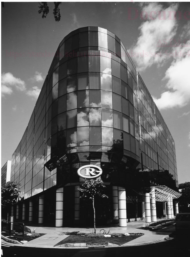
FIG. 3 Four-Side SSG System

four-side SSG systems should be designed for shop glazing of the structural sealant. There are other benefits of shop glazing that can contribute to efficiencies in scheduling and installation, such as, fewer weather-related technical issues to resolve than with construction-site glazing. In general, construction-site structural sealant installation should not be considered without consultation with and approval from at least the structural sealant manufacturer, metal framing supplier, and the glass or panel manufacturer. Typically, system maintenance of a four-side SSG system occurs at the building.