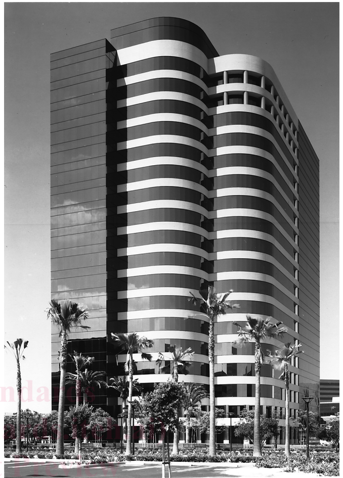
FIG. 2 Two-Side SSG System

16.2.1 A two-side SSG system provides structural support of a glass lite or panel using a structural sealant for two opposite sides of a panel, with the other two sides retained using conventional mechanical fasteners (Fig. 2). Manufactur-