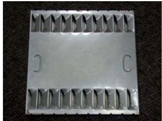
FIG. 3 Cyclone Filter

10.2.3.8 The velocity measurements in a filter bank shall be measured beginning with the filter at one end of the filter bank and ending with the filter at the opposite end.