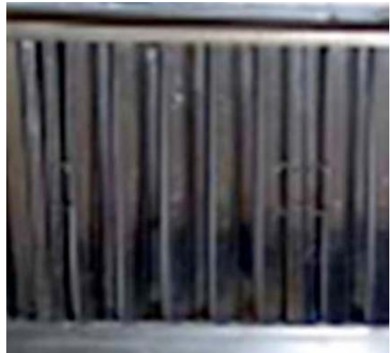
FIG. 1 Baffle Filter

10.2.2.1 These measurements are limited to the use of a 4 in. rotating vane anemometer with its body parallel to and positioned flush to the filter face.