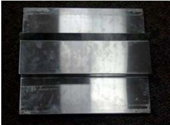
FIG. 5 Slot Filter

10.2.5.4 An accessible straight section of duct is required for the traverse.