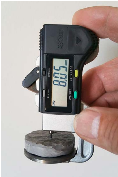
FIG. 2 Micrometer Measuring a Replica Coupon

results for each of the surface preps in this study. Practice E691 was followed for the study design; the details are given in ASTM Research Report No. RR:D01-1165.