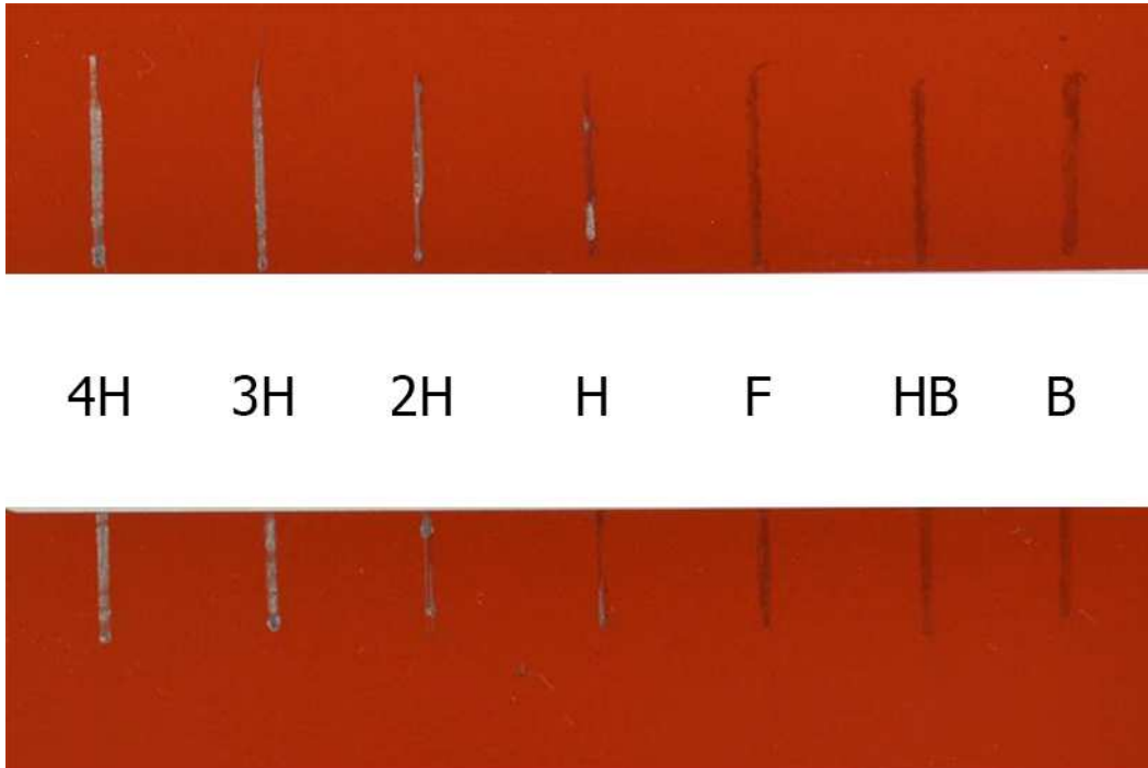
FIG. 2 Typical Example of Pencil Test

iTeh Standards ( https://standards.itih.ai ) Document Preview