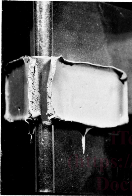
(a) Complete Cracking and Adhesive Failure

5.2 Spatula , steel, with thin knife edge.