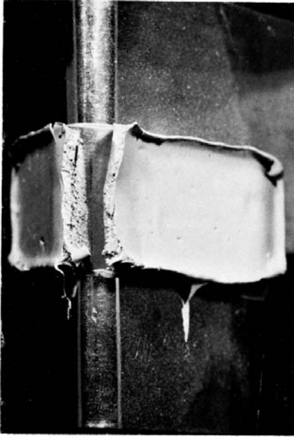
(a) Complete Cracking and Adhesive Failure