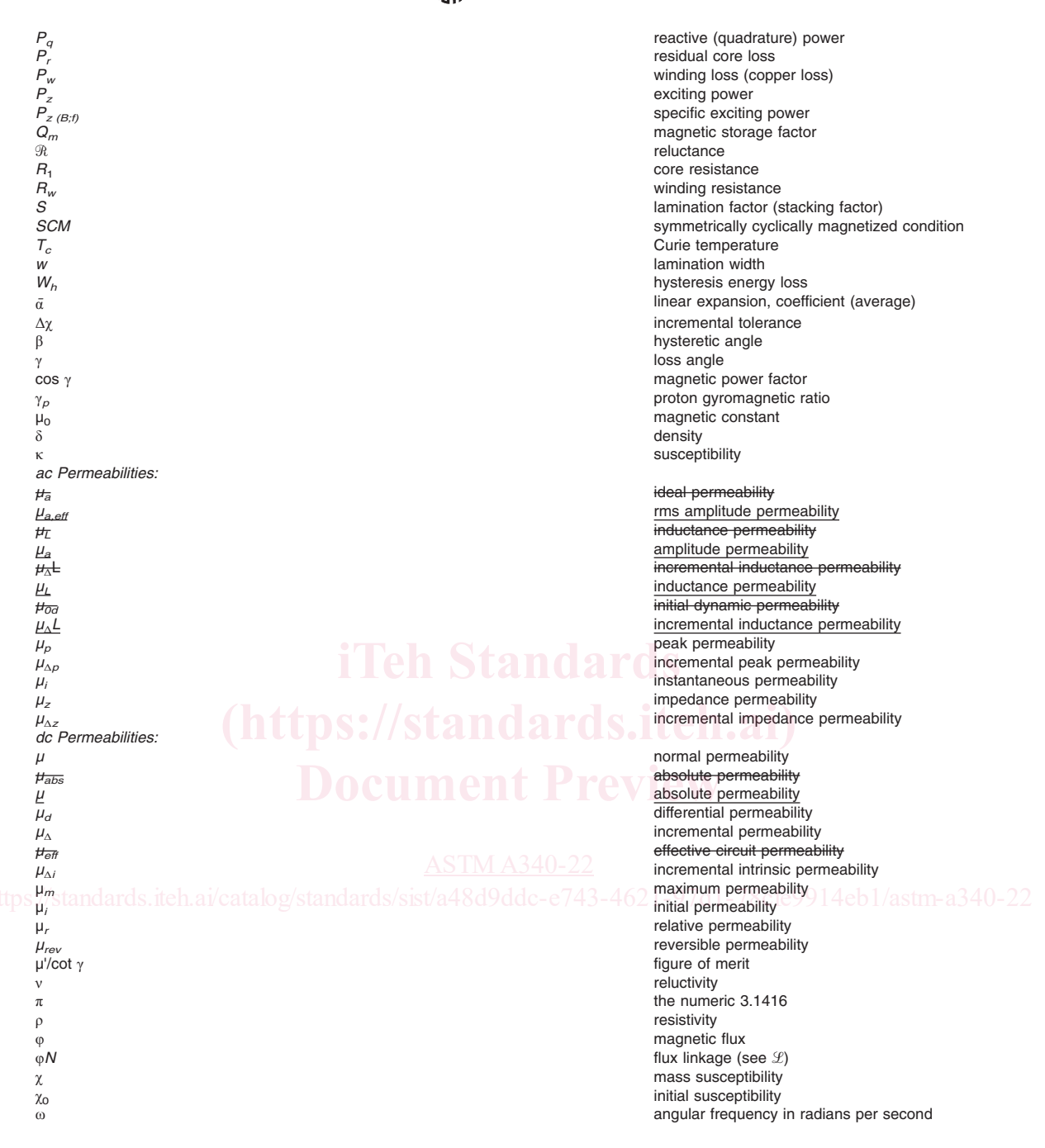
Part 2—Definition of Terms Used in Magnetic Testing

active (real) power, P—the product of the rms current, I, in an electrical circuit, the rms voltage, E, across the circuit, and the cosine of the angular phase difference, \theta between the current and the voltage.