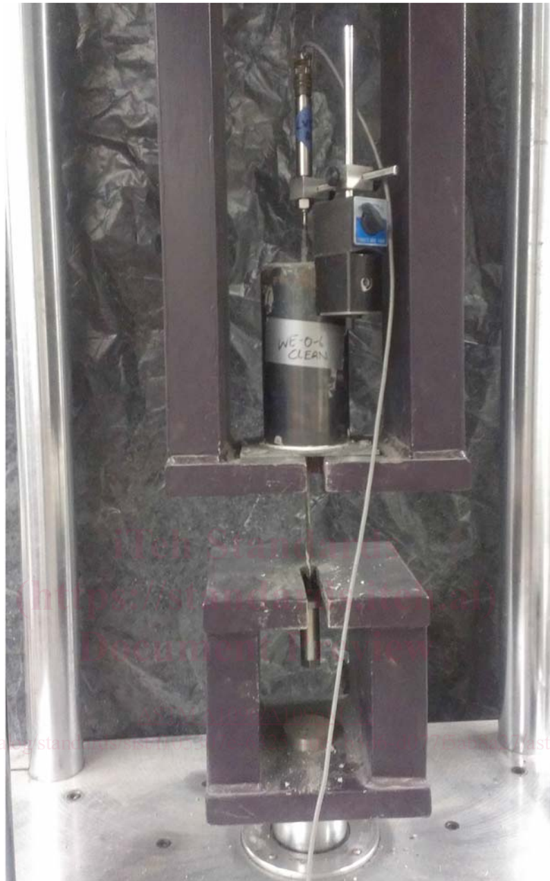
FIG. 1 Photo of Pullout Test Frame and Specimen as the Test is Being Conducted