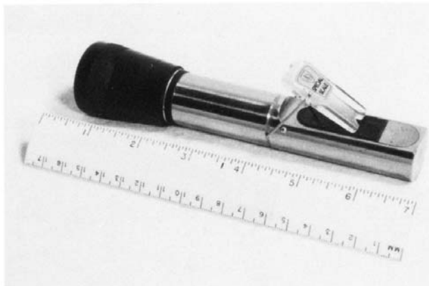
FIG. 1 Typical Hand-Held Refractometer

5.5.2 A general purpose quantitative filter paper in accordance with Specification E832, Type II, Class G, for fine crystalline precipitates in the size range from 0.45 μm, with an ash content of 0.13 mg/12.5-cm circle. Cut filter paper to a diameter of 25 mm.